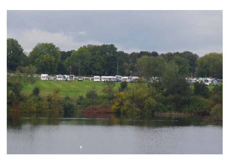
PLEASE REMEMBER IF YOU HAVE BOOKED AND CANNOT MAKE IT TO THE RALLY PLEASE CANCEL WITH THE RELEVANT RALLY MARSHALS