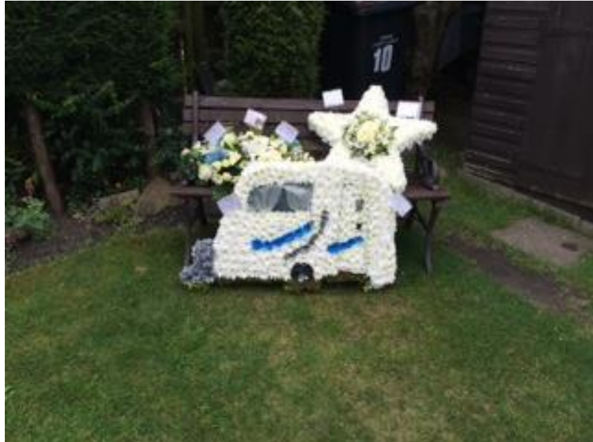
From Jean Plender and Family.

You can view all Durham Centre activities on our website http://www.durhamcentre.co.uk